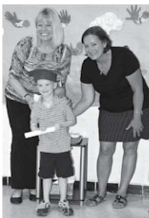
Tolland Tykes Preschool